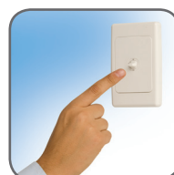
Wall Switch With 240V Electric Motor*