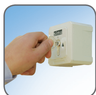
Key Switch With 240V Electric Motor