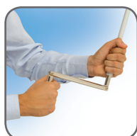
Crank Handle With 240V Electric Manual Override Motor