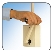
Steel Cable Winder (Up To 50Kg)*