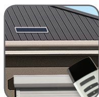
Remote Control With SolarSmart™ Automation 12V Motor (Up To 50Kg)