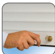
Spring Loaded With Key Lock