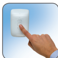
PowerSmart™ Control System With 12V Motor (Up To 50Kg) †*