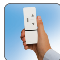
Remote Control With 240V Electric SIMU Hz Motor