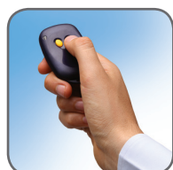
S-05 Remote Control (Key Ring Transmitter) With 240V Electric Motor & Multi-Function S-05 Radio Receiver & Control Unit

† When used in conjunction with an assist spring as per CW Products specifications.